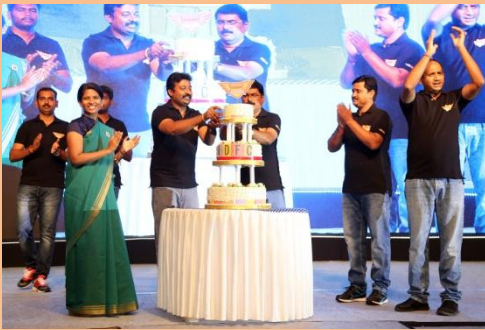
Param - Regional Meet, Coimbatore