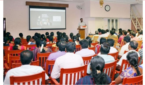
Performance Appraisal Training