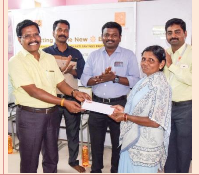
Saving Product launched at Maharashtra & Karnataka