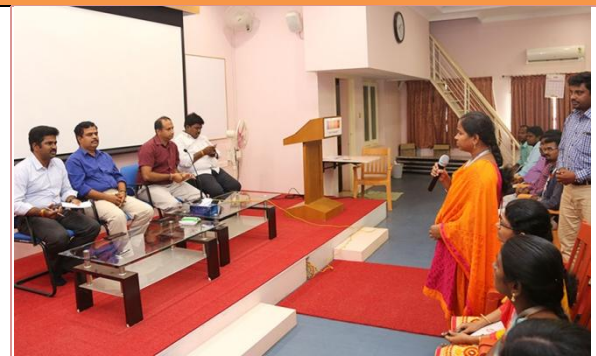
Suvidha Shakti Micro Housing Loan Refresher Training to BOM