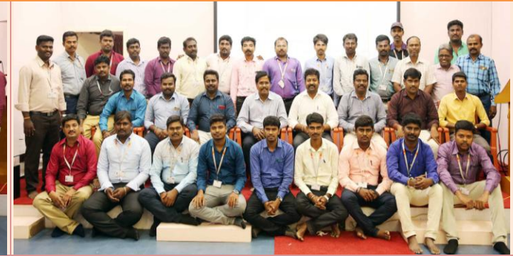
Induction & Department level Training to Branch Credit Managers.