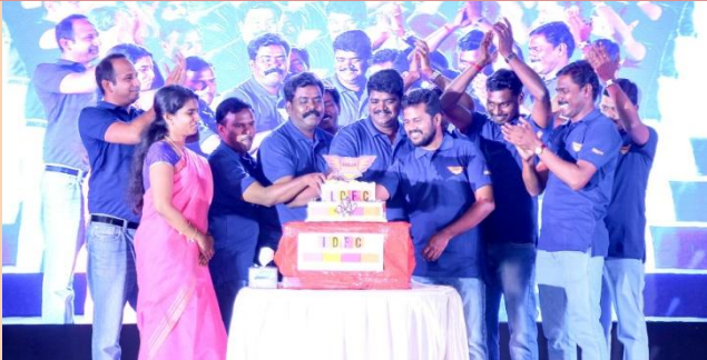
Kerala State Meet was held at Munnar on March 22, 2018