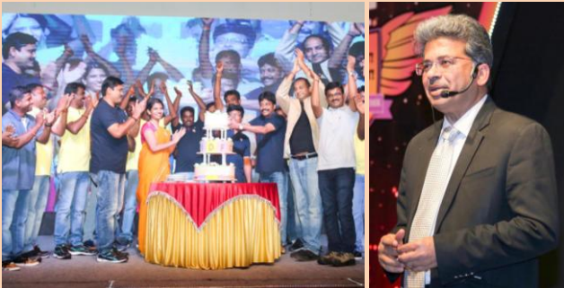
Chennai-Chidambaram Regional Meet was celebrated at Chennai on March 16, 2018