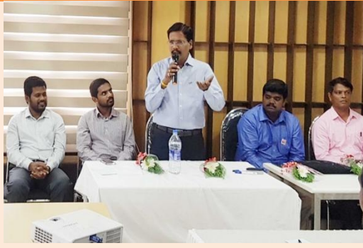
Savings Product launched at Kerala & RSD Training to BMs & BOMs.