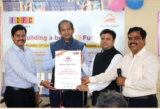
Suidha Shakti Micro Housing Loan Launch